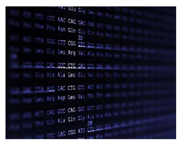
The data deluge is occuring in almost every discipline of research.

On 1 October 2011, the EUDAT project, co-funded by the European Commission's Framework Programme 7, was launched to target a pan-European solution to the challenge of data proliferation in Europe's scientific and research communities. The project aims to contribute to the production of a Collaborative Data Infrastructure (CDI) driven by researchers' needs, and is coordinated by CSC - IT Center for Science, Finland. It comprises 25 European partners, including data centers, technology providers, and research communities and funding agencies from 13 countries.