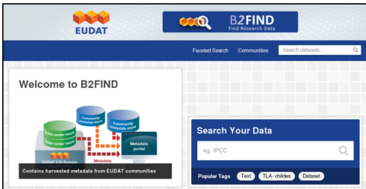
Figure 1. The EUDAT B2FIND service main screen. By entering text in the provided free text field "Search your data" you can perform a full text search over the whole catalogue directly from the home page.